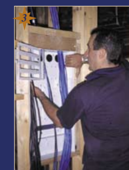
Cabinet is placed into wall ready to be screwed into its fixed position.