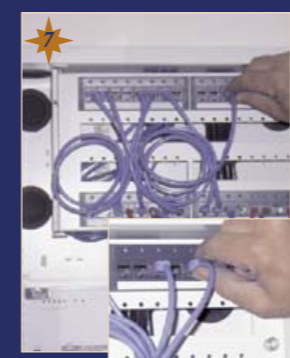
Patching in the phone and data points.