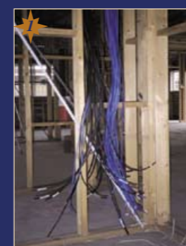
Layout of cabling completed and running back to StarServe hub in preparation for installation of cabinet.