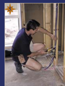
First fixing to StarServe points.