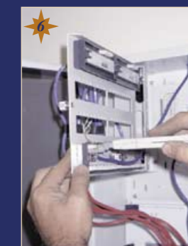
Terminating Cat 5 using Krone tool.