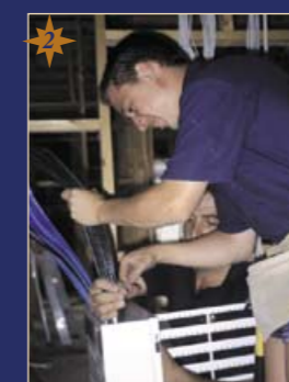
Cables are passed through entries on cabinet, ready to be mounted into wall.