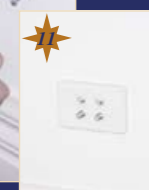
Second fixing of outlets complete.