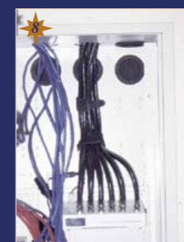
StarServe Video Hub provides whole-house distribution for Antenna and CATV signals at up to 8 television locations.