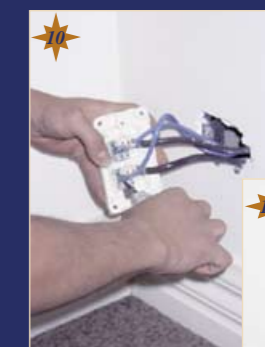
Terminating StarServe outlets.