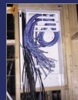
Cabinet is fixed in wall.