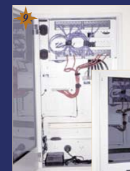
Second fixing to StarServe cabinet complete.